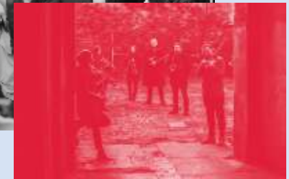
RADICAL POLISH ANSAMBL